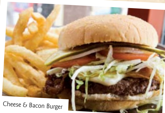
Cheese & Bacon Burger

100% Pure beef patty with slices of mozzarella, Swiss and cheddar cheese, lettuce, onion, tomato, pickle and three slices of bacon. $11.45