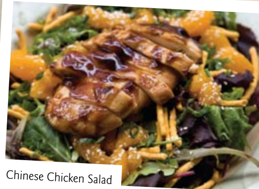
Chinese Chicken Salad

Mixed greens, delicious red and green seedless grapes, sliced almonds, radish slices and feta cheese. Goes best with raspberry or Greek vinaigrette dressing. This is sure to be a favourite! $12.25